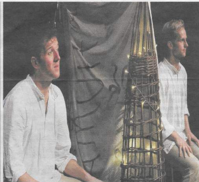
↑ The life of the community from beginning to its end is told with humour and compassion